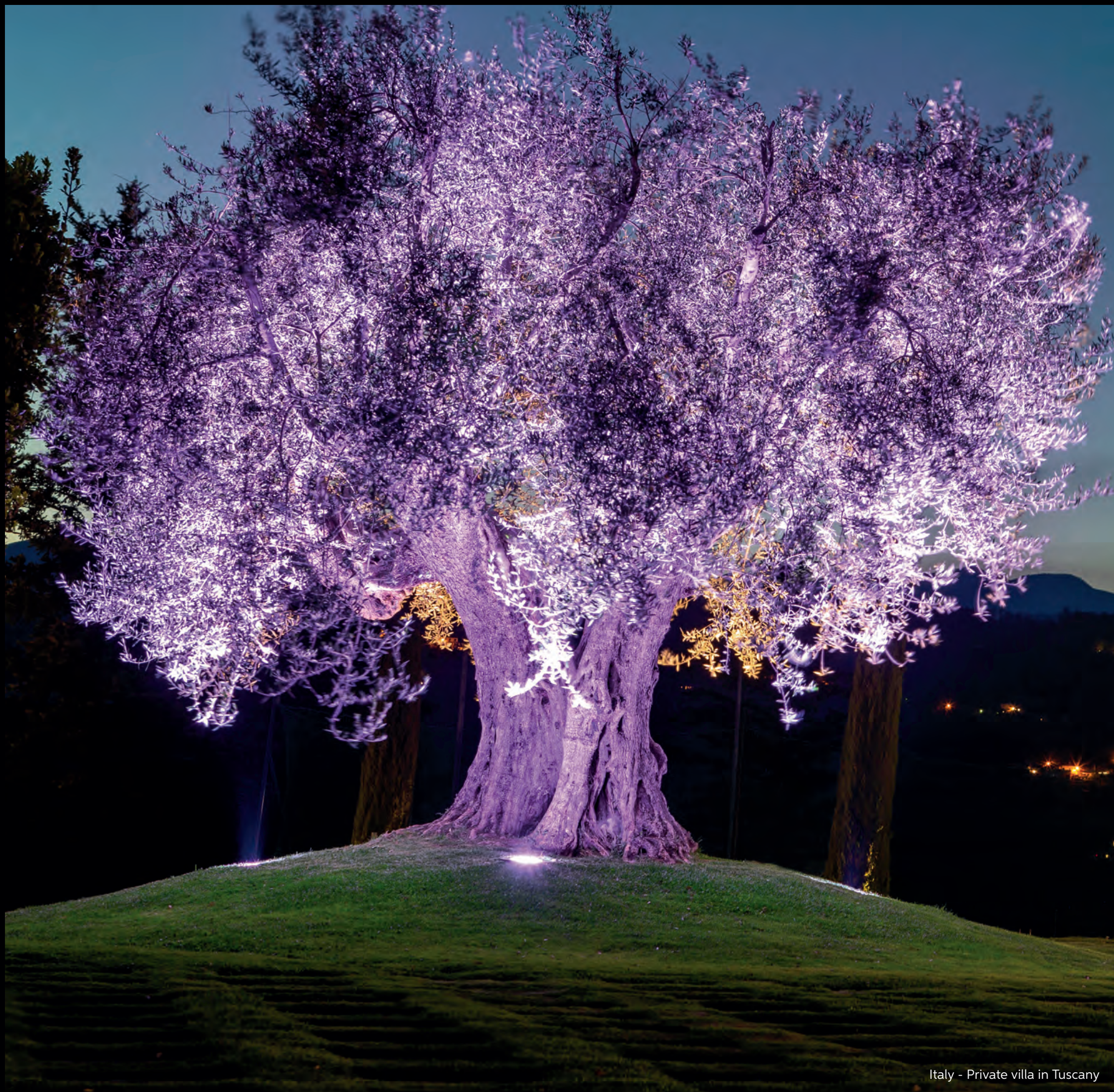
Italy - Private villa in Tuscany